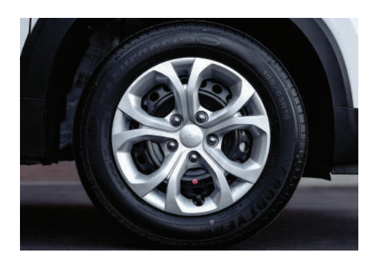
15" Steel Wheel