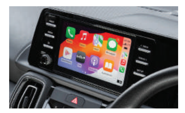
8-inch touch screen infotainment In addition to its easy touch controls for the audio system, the 8-inch audio display can show the screen image of a paired, compatible mobile phone by wireless phone projection using the Android Auto and Apple Carplay apps.

With ample cargo space for a variety of small and medium-sized items, the Sonet Panel Van is not just about utility. Get your business moving with sufficient comfort to keep you going, and simple connectivity to keep you entertained and informed.