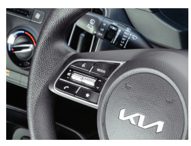
Bluetooth with voice recognition

The new Sonet offers the protection of a dual front airbag SRS system. High strength steel is applied throughout to improve rigidity, redirect impact forces, and protect the cabin and its occupants.