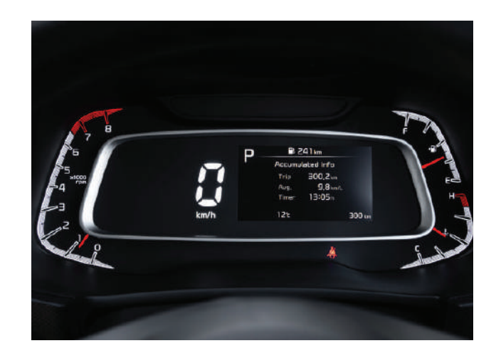
4.2-inch instrument cluster and colour display