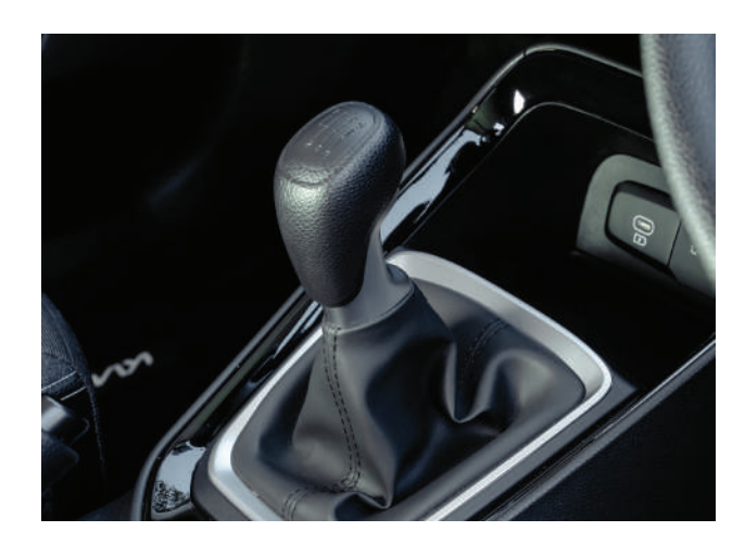
6-speed Manual Transmission